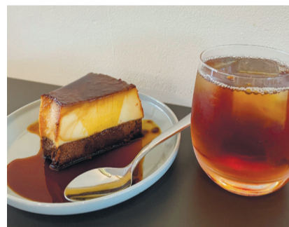
The Brazilian pudding set from TOKAKU coffee+ REI SATO

The iki ESPRESSO staff recommend the “Eggs Benedict.” The cafe is New Zealand themed, so you can try many foods and sweets that are not commonly found in Japan. Iki ESPRESSO is also very particular about its coffee, so you can drink high-quality coffee roasted in-house from more than 10 types of beans. If you don't like coffee, they recommend teas or a hot chocolate. This store is also pet-friendly, so it's a good place to drop in for