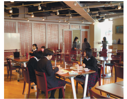
The eating space inside CAFE MiyakoDori.