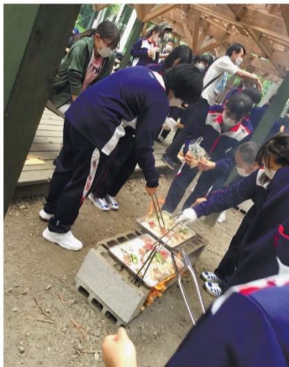
The students cooking together on the first day.

Nakamura High School holds the "Kenshuugasshuku" at Lake Yamanaka in Yamanashi Prefecture for four days in June for fourth-grade students. The residential camp aims to build relationships and strengthen bonds between students. According to the results of a survey of 40 fourth-year students, the ekiden long-distance relay and curry making were the most enjoyable accounting for 25 % of the responses. The ekiden relay begins on the second day and