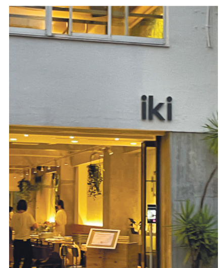
iki ESPRESSO cafe HAZUKI TOMINAGA

TOKAKU coffee+: 135-0023 Tokyo-To, Koto-Ku, Kiyosumi-sanchome 1-3 iki ESPRESSO: 135-0006 Tokyo-To, Koto-Ku, Tokiwa-nichome 2-12 1st floor