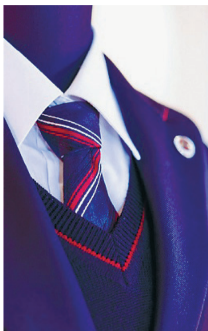
The stunning Nakamura uniform NAKAMURA GAKUEN

Q: What were your main concerns? We wanted to maintain the values of both the middle and high schools. We looked at many fabrics, colors and patterns to best express each of them while upholding harmony. We also wanted it to be comfortable. The blouse is opaque and well-fitted and the jacket is light. In addition, we used Zque New Zealand Merino