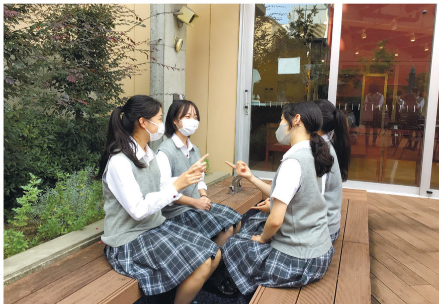
Nakamura students chatting in the outside space of the cafe NAKAMURA GAKUEN

and think about their health, we want to do everything we can to help them.” CAFE MiyakoDori says that when the pandemic is over, it wants to serve some fresh dishes and ice cream that everyone will love. We hope to be able to enjoy freshly cooked lunches again soon!